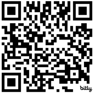
Community Event Sponsorship Form

We're looking forward to working with you! Go to rec.troymi.gov/sponsorships to learn all about sponsorship opportunities and complete your desired sponsorship form, or scan the QR codes directly to the forms.