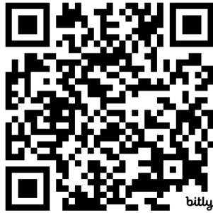
Senior Event Sponsorship Form