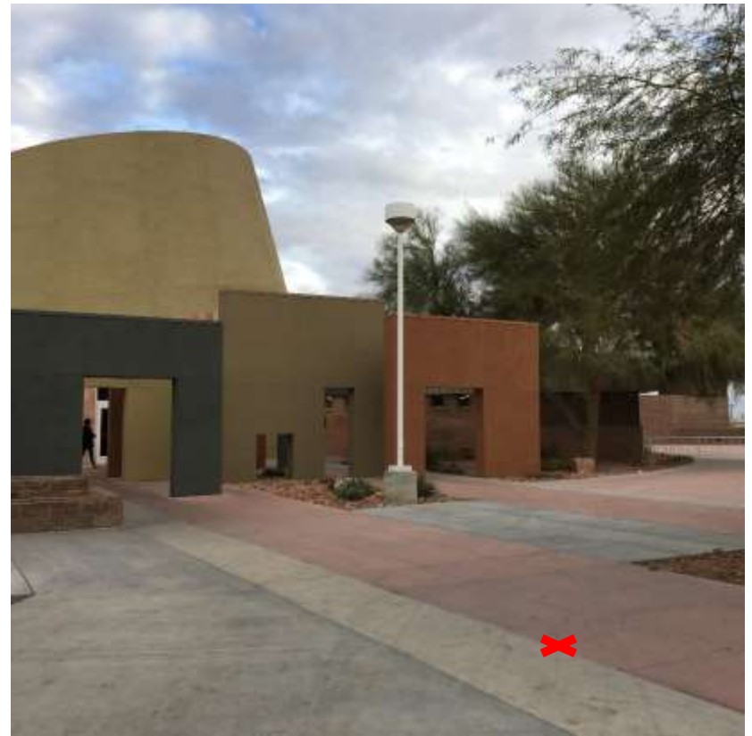
Area 2: Area near tree adjacent to main entrance sidewalk