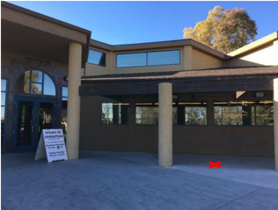
Designated area: 20 feet north of the main entrance