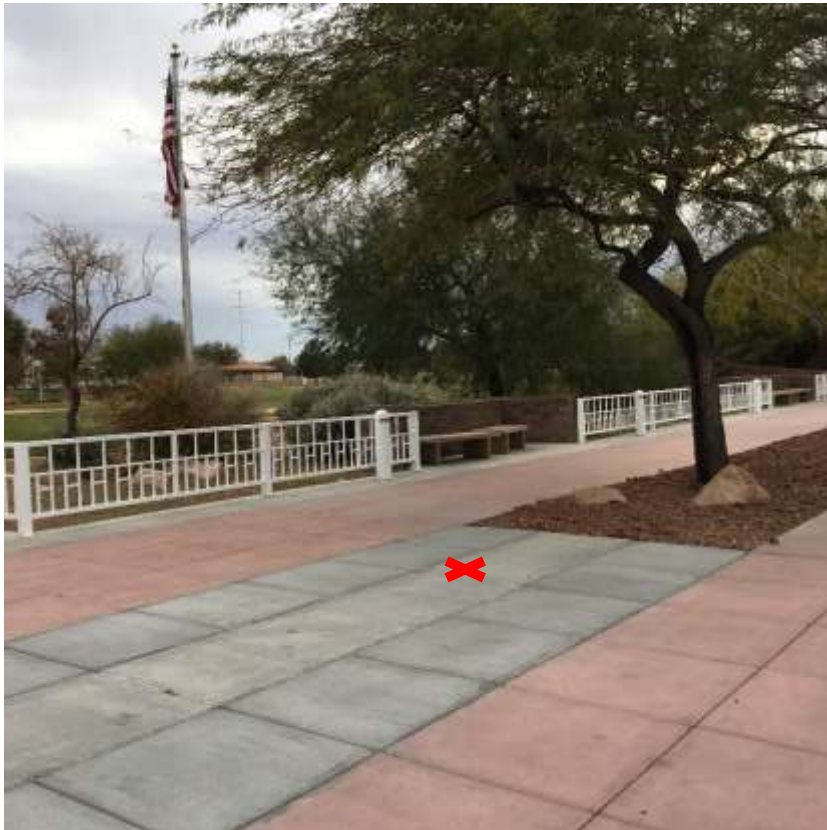
Designated area: Main entrance in front of flag pole under tree