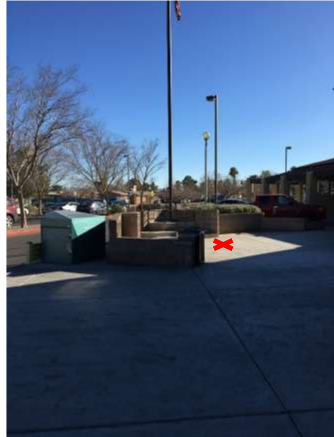
Area 2: Flagpole alcove