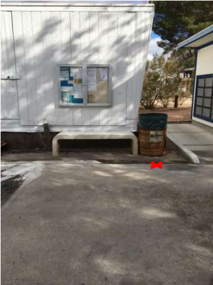
Designated area: Near bench at the south side of the building