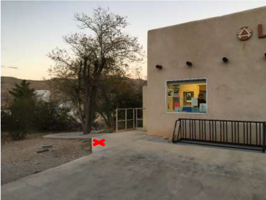
Designated area: At the northwest front of the building