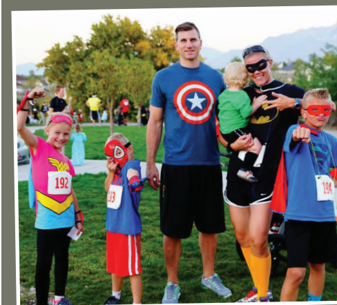
Troll Stroll 2014

Dress up in your favorite costume, receive prizes, and enjoy a fun night out the entire family will enjoy!