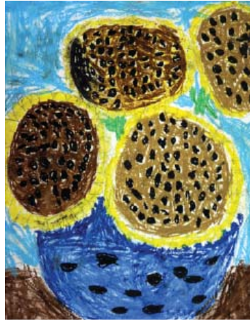
Art work by Lincoln-Titus ES student artists