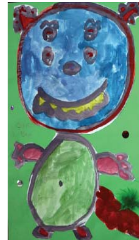
Art work by Thomas Jefferson Elementary School student artists