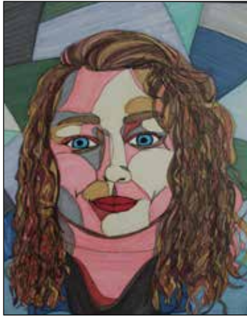
Art work by Lakeland High School student artists