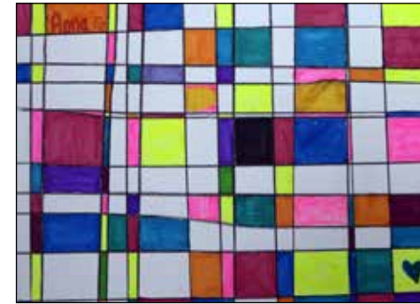
Art work by Benjamin Franklin Elementary School student artists