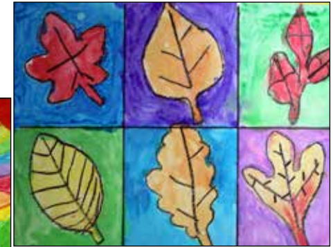
Art work by George Washington Elementary School student artists