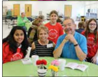
Throughout the school year, our schools welcome members of the senior citizen community into the schools including Lakeland Copper Beech Middle School's 'Day at the Beech' (above) and Ben Franklin Elementary School's Senior Tea (right).