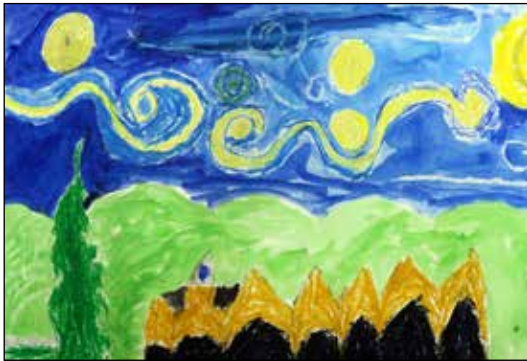
Art work by Lincoln-Titus Elementary School student artists