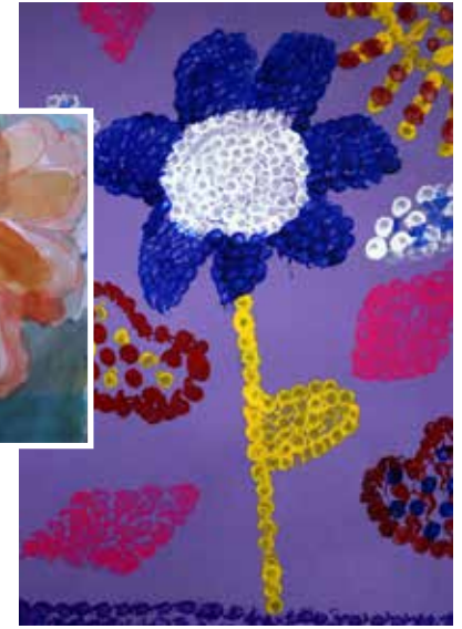
Art work by Benjamin Franklin Elementary School student artists